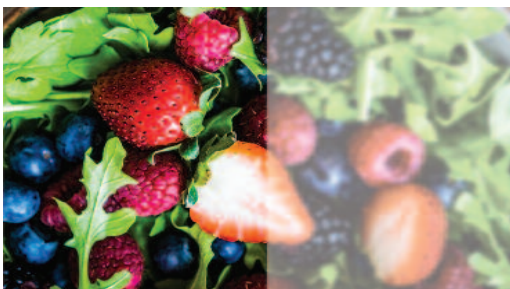
Viewed through material with low haze